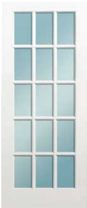
15 – lite French door

Doors available in Passage, Bi-fold, Bi-pass and Pocket also available in solid pine (unfinished)