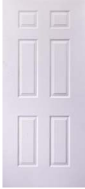
Raised Panel No – lite