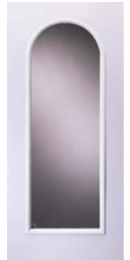
Full View Round top