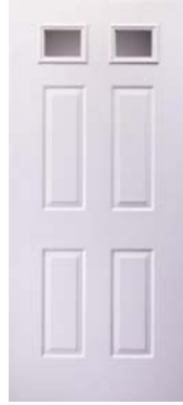
Raised Panel 2 – lite