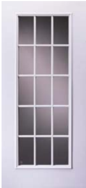
Full View with grids