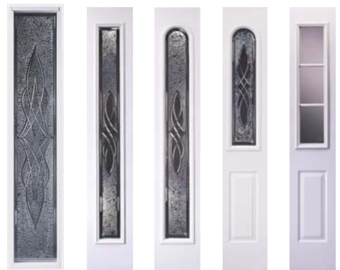
Side lites available in Clear with or without Grids