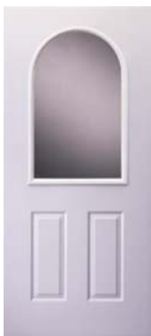
Raised Panel Circle top