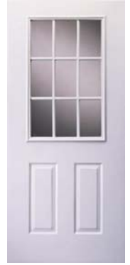
Raised Panel 9 – lite