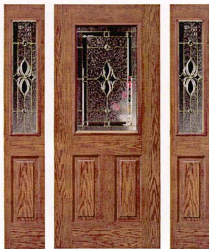
door sidelite Fiberglass Textured DE4 HM-B-2 Fiberglass Textured SDE6 HM-B