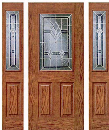
door sidelite Fiberglass Textured DE4 RA-Z-2 Fiberglass Textured SDE6 RA-Z